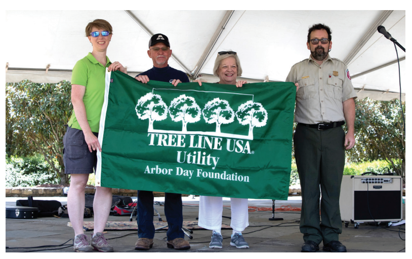
Wake Forest Power has been named a "Tree Line USA" utility by the Arbor Day Foundation. The award is presented during the Town's annual Arbor Day Celebration.

Wake Forest Power conducts an extensive year-round line-clearing program safely trimming trees and clearing brush from more than 70 miles of distribution lines and keeping the bases of nearly 1,400 distribution poles free of vegetation. Tree trimming is an integral part of complying with state and federal laws and providing increased service reliability to customers.