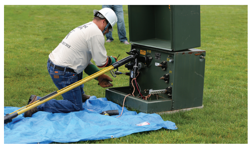
Crews need access to the front of pad mount transformers. Please keep 10 feet of space in front of the transformer clear of shrubs and plantings.

Be mindful of power lines when planting trees. For underground power lines, trees should be planted far enough away from the pad mount equipment that when they reach maturity, overhanging branches won't obstruct a crane from removing a defective transformer or setting a new one. Trees, shrubs and other landscape plantings should not be placed on the utility easement above underground electric cable. Do not change the grade around equipment to avoid problems with access and