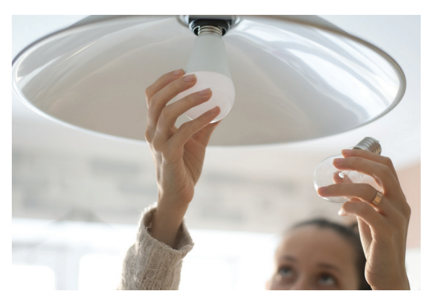
Replace incandescent light bulbs with energy-saving bulbs.