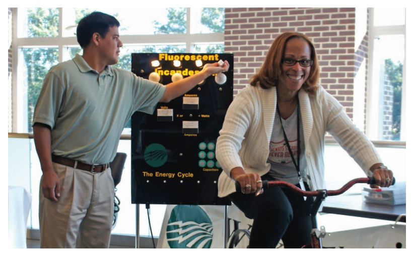
Learn about power through interactive displays during Public Power Week.

Wake Forest Power has earned the RP3 designation continuously since 2007. The designation is active for three years, after which time a utility must reapply.