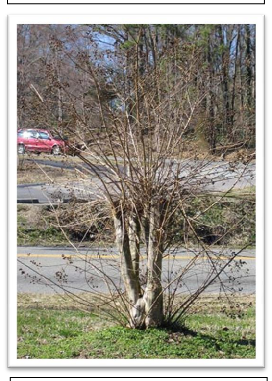
Figure 12 : Subsequent Years – extreme topping results in a tree with none of the qualities admired in the Crape myrtle. It won't form exfoliating bark and bloom production is severely restricted.