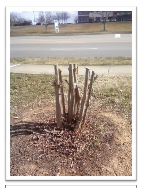
Figure 10: First Year – extreme topping. With cuts exceeding 2" in diameter at a height below 4' – this is an example where it's probably best to start over.