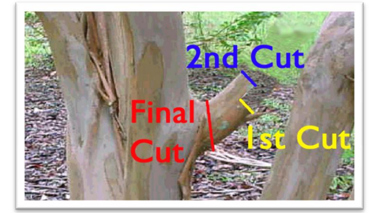
Figure 5 : For heavy branches, it is best to make the cut in three steps. The first two cuts are release cuts that keep the trunk from peeling. The final cut is placed to remove the branch stub, but leave the branch collar.

Figure 4 : Prune to remove branches growing into the center of the tree and crossing or rubbing branches, retaining more desirable branches. This branch should have been removed much sooner, but it is appropriate to remove it now by cutting it back to the next limb. Make your cut so that the branch collar remains.