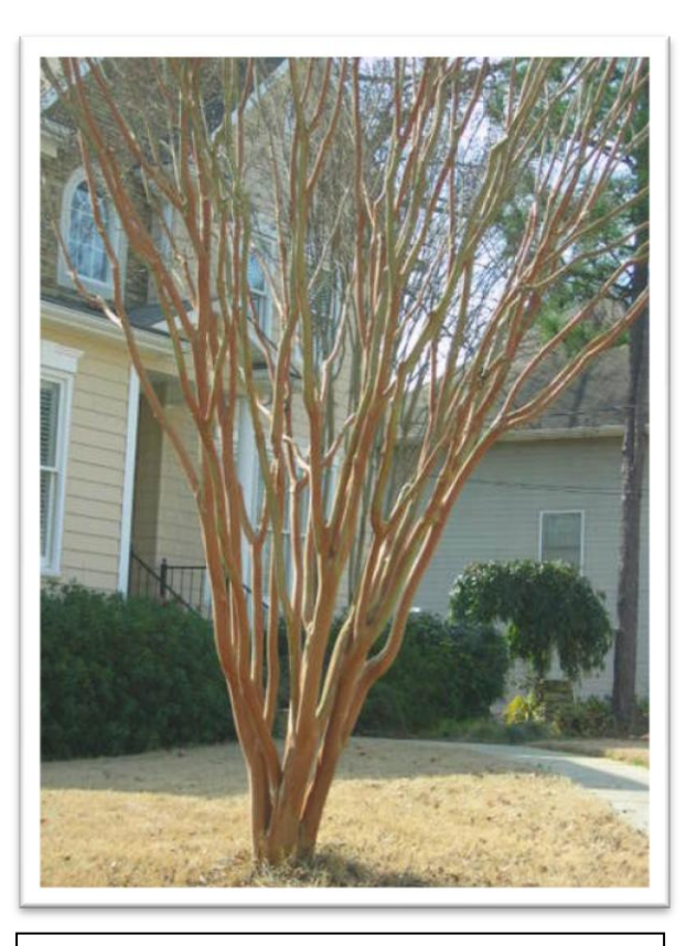
Figure 7: After – This Crape myrtle has been opened up with proper pruning.

Figure 6 : Before – This Crape myrtle needs to be opened up to allow air into the center of the tree, remove crossing branches and lift the canopy slightly.