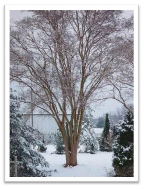
Figure 8: Japanese Crape Myrtle Lagerstroemia fauriei 'Fantasy' Champion Crape Myrtle

You can see one of the largest and oldest specimens of Japanese Crape myrtle growing outside Japan. During the 1950s, John Creech (U.S. National Arboretum) collected seeds on the island of Yakushima in Japan. One seedling variant resulted in 'Fantasy', which J. C. Raulston named for its unusual upright, vase-like form.