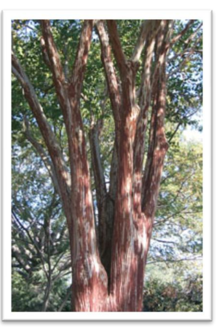
Figure 9: Note the maturity of the trunk with exfoliating bark revealing the cinnamon bark beneath.