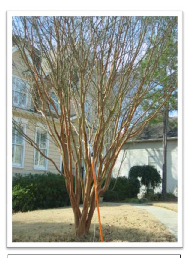
Figure 6 : Before – This Crape myrtle needs to be opened up to allow air into the center of the tree, remove crossing branches and lift the canopy slightly.