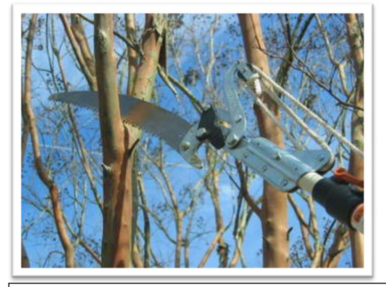
Figure 4 : Prune to remove branches growing into the center of the tree and crossing or rubbing branches, retaining more desirable branches. This branch should have been removed much sooner, but it is appropriate to remove it now by cutting it back to the next limb. Make your cut so that the branch collar remains.