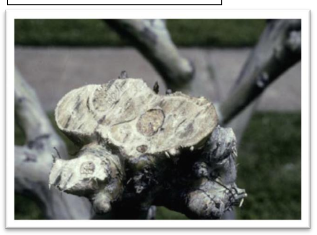
Figure 11 : Improper pruning resulted in the trunk rot and tree death depicted in these two images.

Severe pruning, topping, or stumping can kill even the hardy Crape myrtle. More often, it destroys the natural form leaving a tree forced to act like a shrub with dense foliage on weak canes extending straight up from the cuts like straw from an old broom. This dense foliage creates conditions favorable for the formation of powdery mildew and reduces bloom period and number.