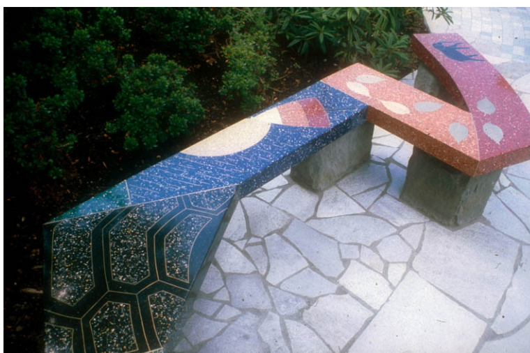
Seattle, WA Benches and paving at Village Square by Norie Sato

Public Art Funding Public Art Resolution Public Art Ordinance