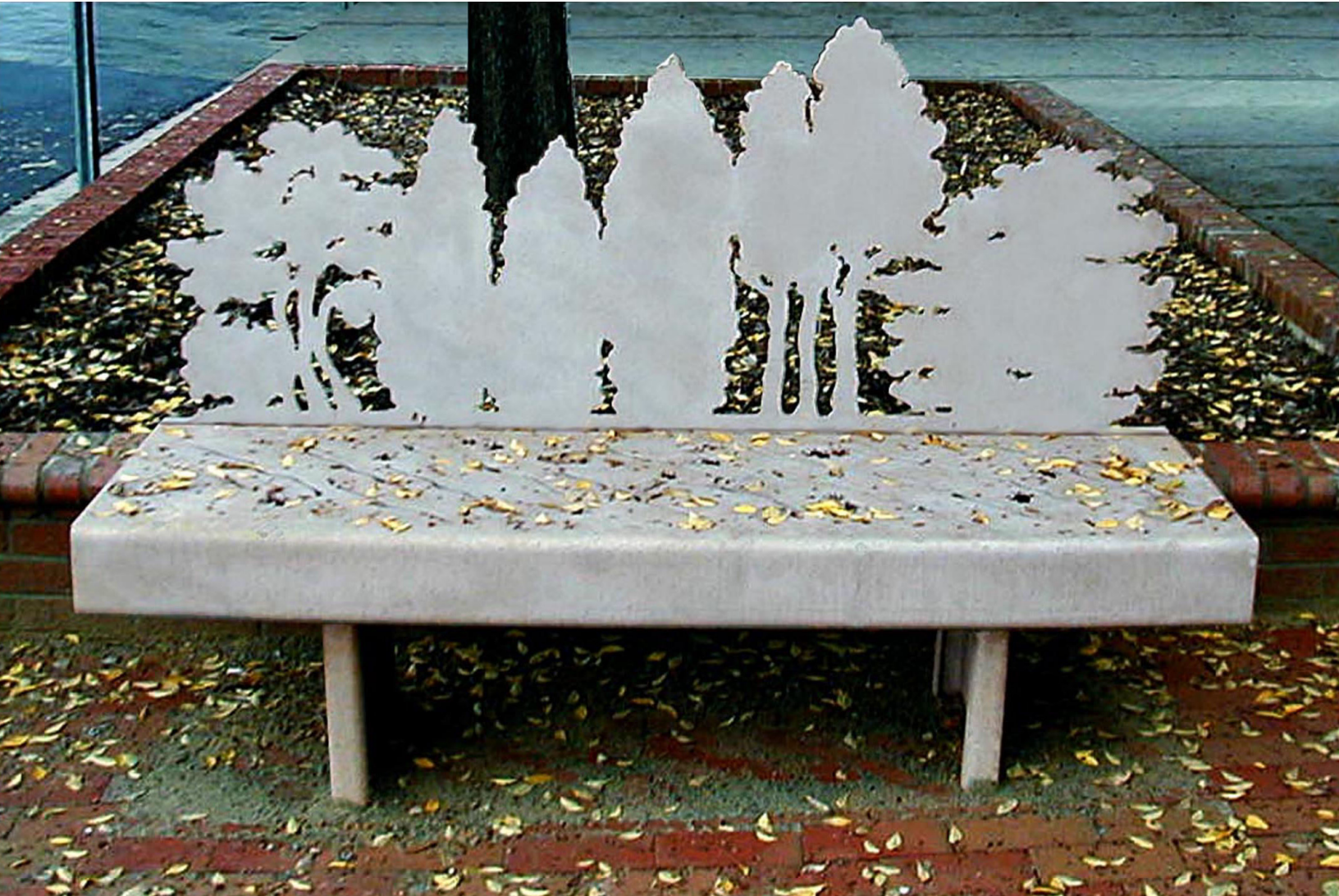
Chapel Hill, NC "Treescapes" by Arlene Slaven

Public art creates goodwill and enhances community image— two goals that local governments aim to achieve.