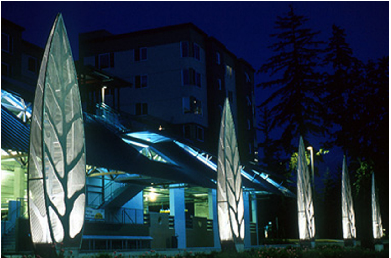
Redmond, WA "Standing Leaves, Falling Light" by Barbara Gyrgutis

insurance for the duration of the loan. Acceptance of a gift or loan of artwork by the Town of Wake Forest means a commitment to its preservation, protection, and display for public benefit. All materials used in the creation of the work must last in a public, non-archival setting. Each donor should be encouraged to provide funding for the ongoing maintenance costs of their gift and be encouraged to make their gift without restrictions or stipulations.