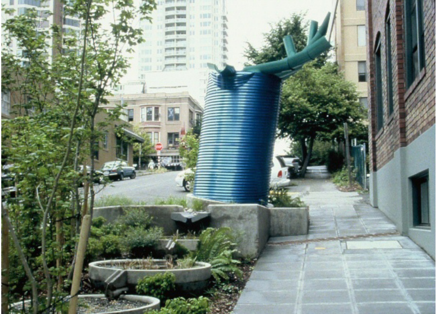
Seattle, WA "Beckoning Cistern" by Buster Simpson

Unlike any other investment, a typical public art project generates both tourism and community interest.