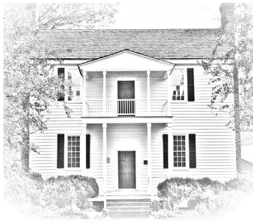
The circa 1820 Calvin Jones House