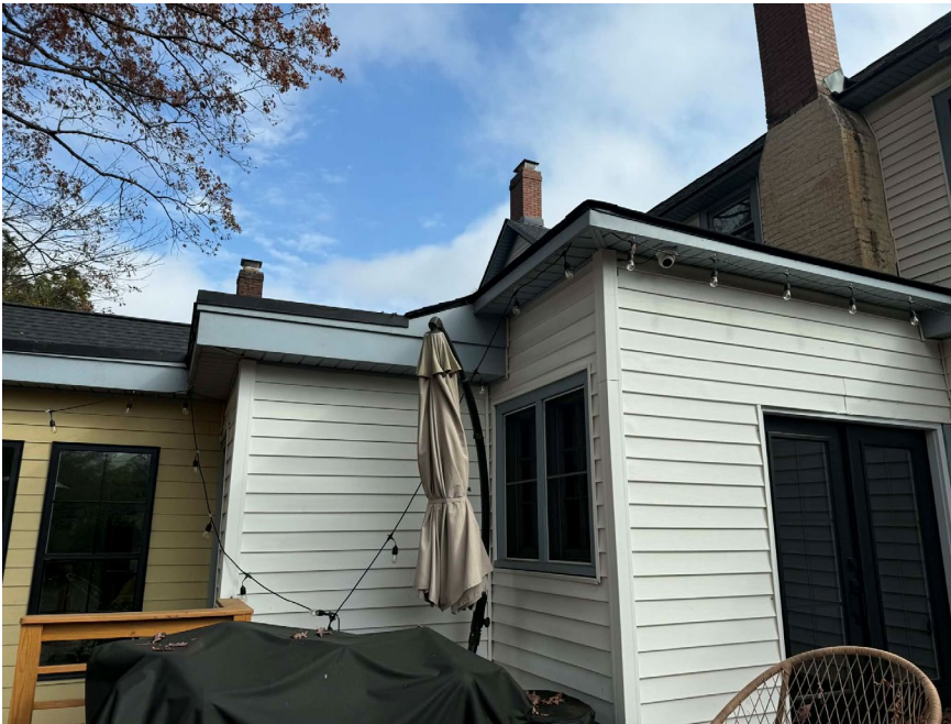
Photo 8: Gutters will be added to the back of the house to match the gutters on the front of the house.