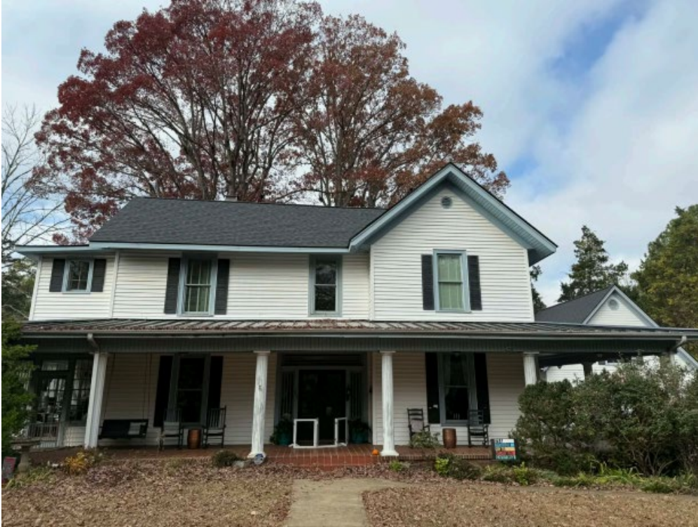
Photo 1: Primary façade showing columns, vinyl siding, aluminum window trim, and synthetic shutters to be removed.