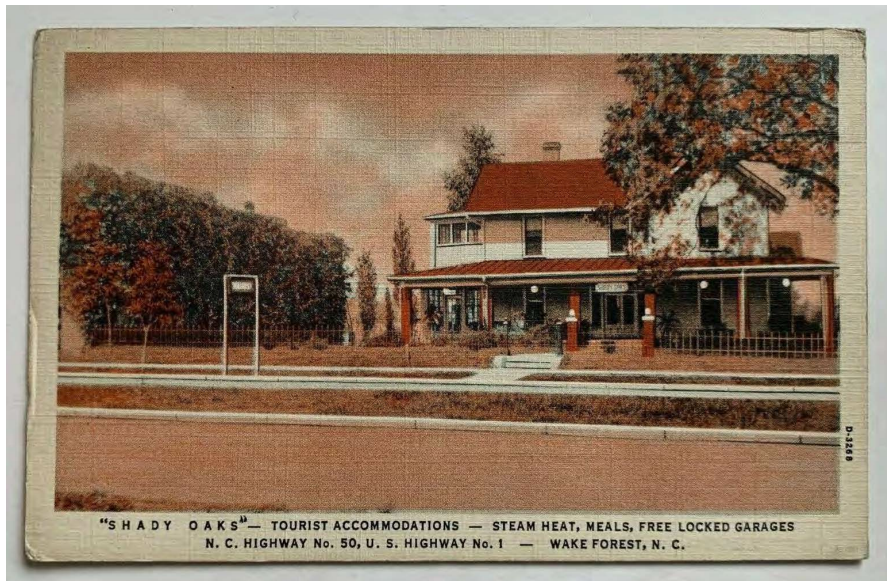
Photo 3: Postcard of “Shady Oaks” showing c. 1920 wraparound porch with brick columns. The brick columns were removed in the 1980s and replaced with existing metal columns.