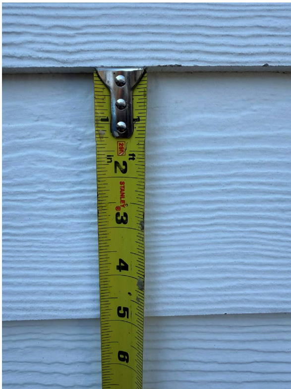
Photo 10: Hardie-plank siding on the garage. If Hardie-plank is used to replace the vinyl siding, it will match this grain pattern.