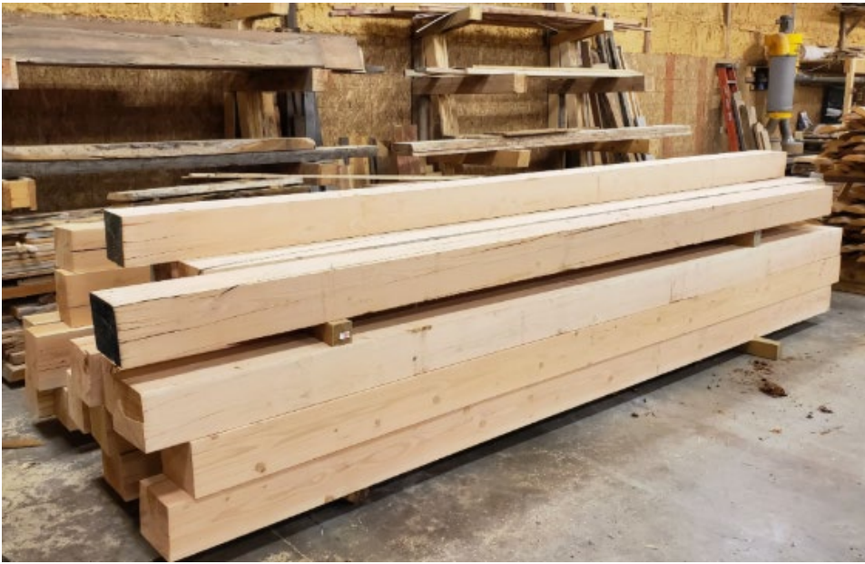
Photo 7: Wood 6x6 posts to replace metal porch columns. Posts will be painted.