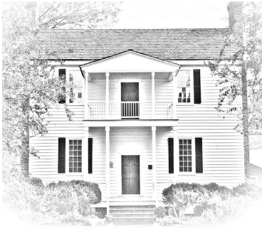
The circa 1820 Calvin Jones House