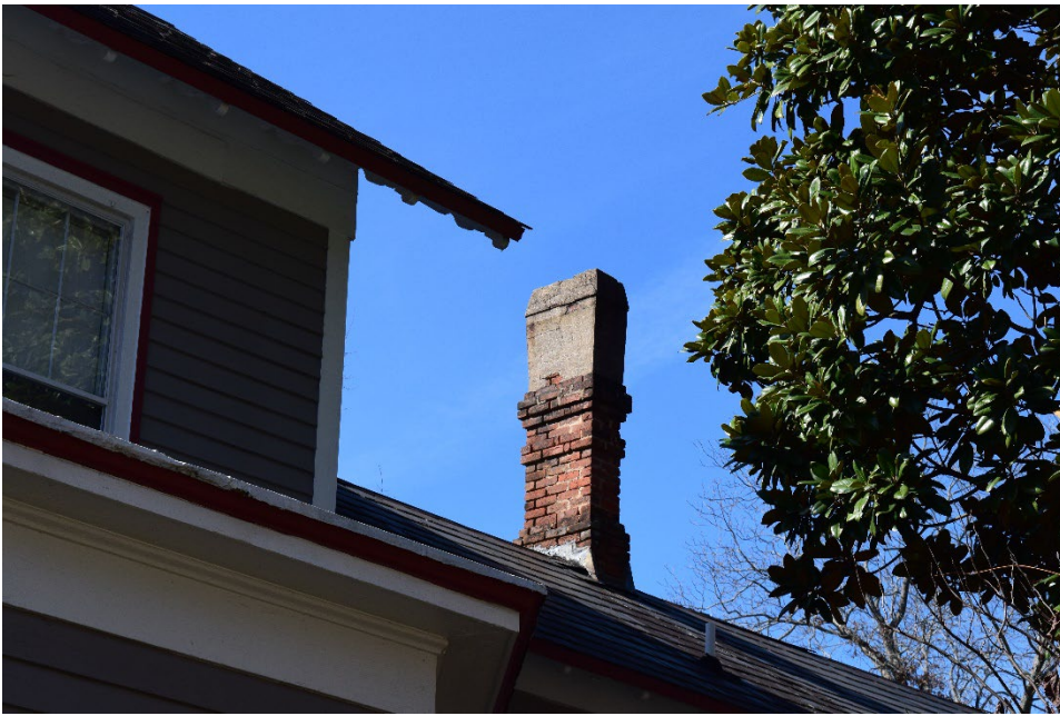
Photo 5: Secondary chimney to be removed; concrete cap compromises structural integrity.