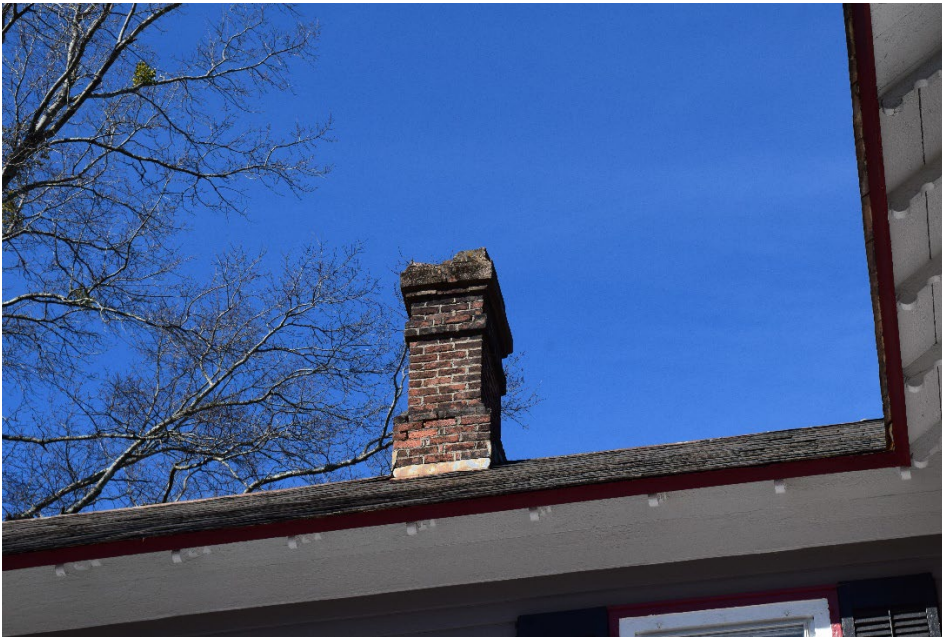
Photo 2: First extant primary chimney that will be repaired in-kind.