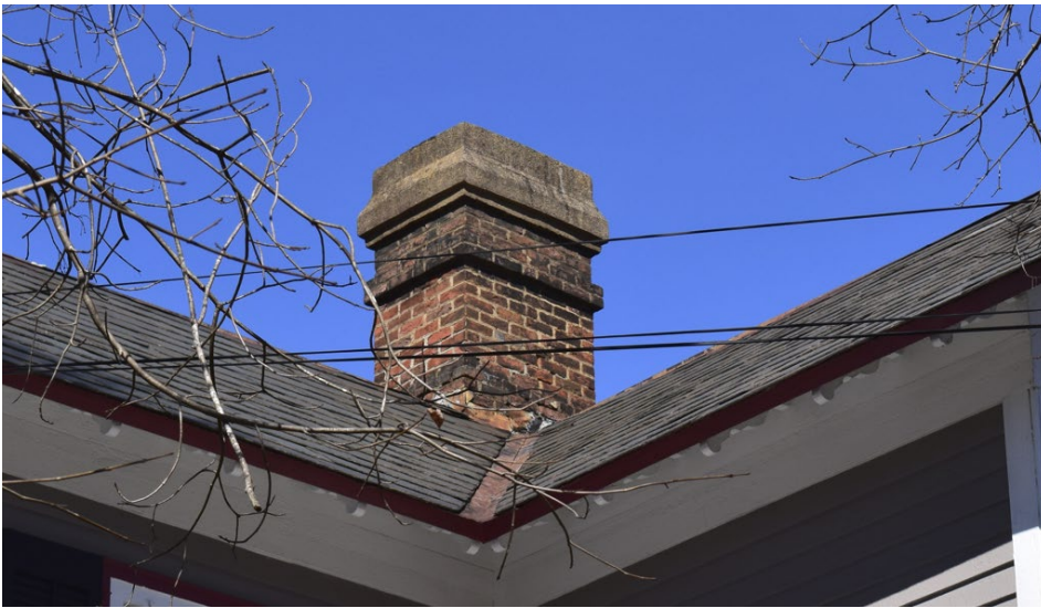
Photo 3: Second extant primary chimney that will be repaired in-kind.