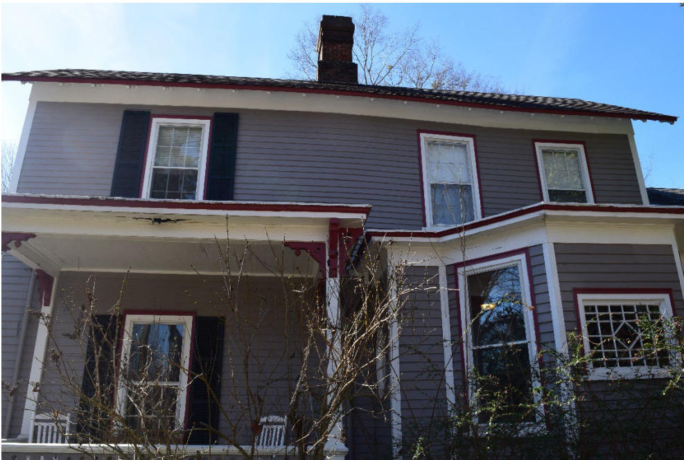
Photo 6: North façade; gap between roofs of porch and bay window might be bridged.