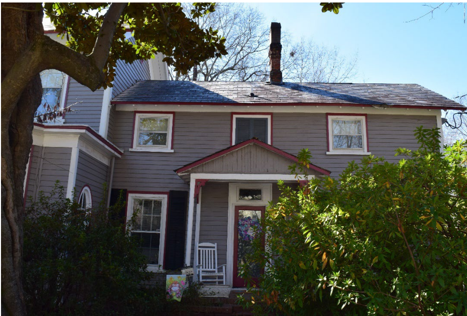
Photo 4: Kitchen addition showing secondary chimney that will be removed.