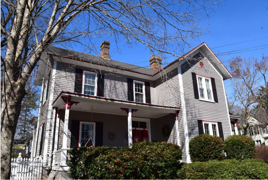
Photo 1: Primary façade showing slate roof to be replaced and porch roof will be copper.