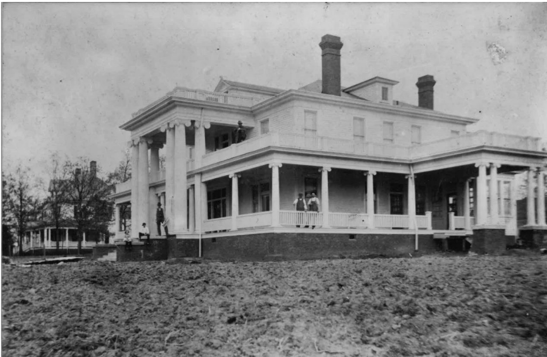
Photo 5: Documentary photo taken shortly after construction in 1912.