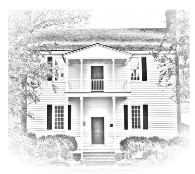
The circa 1820 Calvin Jones House